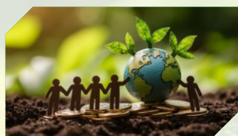
Social Impact & Responsible Growth