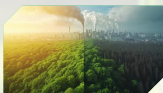
Decarbonisation & Climate Resilience