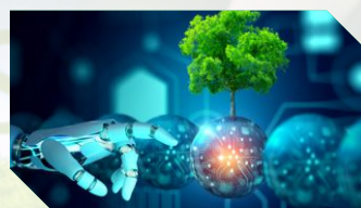
AI Role in Accelerating ESG Transformation