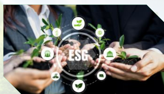
New ESG Regulations