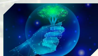
Technology, Innovation & Finance for ESG Transformation