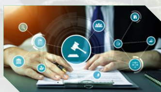
Governance, Transparency & BRSR Implementation